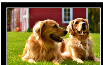
Horizontal shots like this!