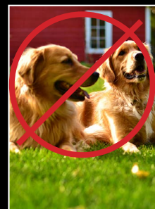
NOT like this... this is vertical!